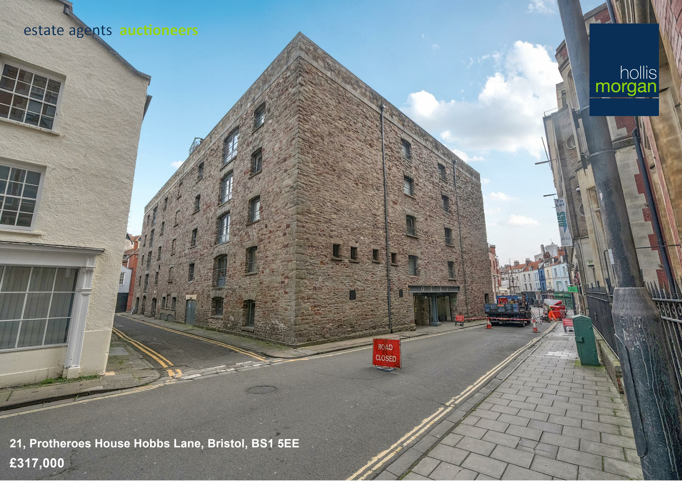
21, Protheroes House Hobbs Lane, Bristol, BS1 5EE £317,000